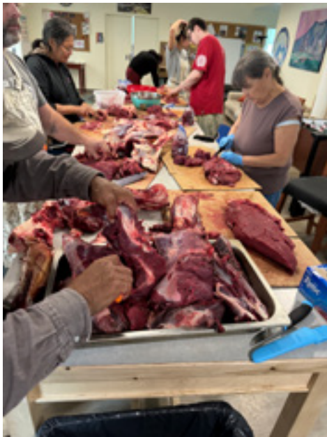
Processing moose meat at the K'äjìt-in Zho