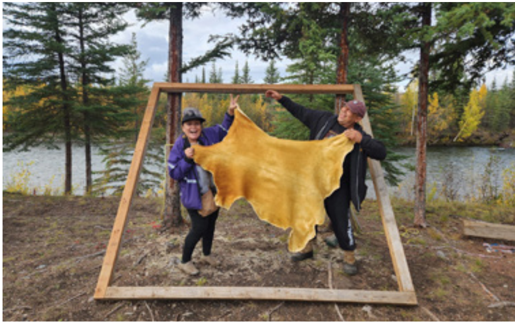
Fall Hide Camp - 5 -10 September 2024