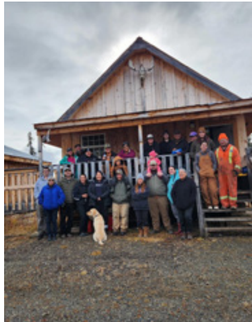
Fall Harvest Camp - 20 -23 September 2024 Pictured to the right: Learning how to prepare a rabbit and skinning moose legs.