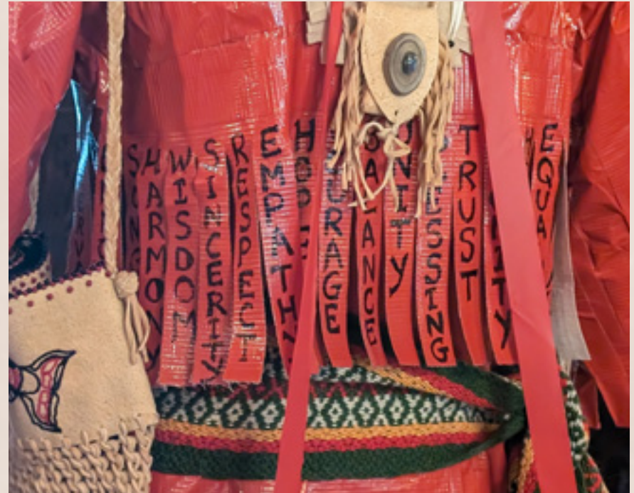
Faye Chamberlain's "Cutting Through Red Tape" dress.