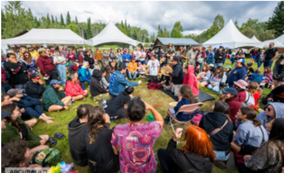
Handgames with the Yukon First Education Directorate