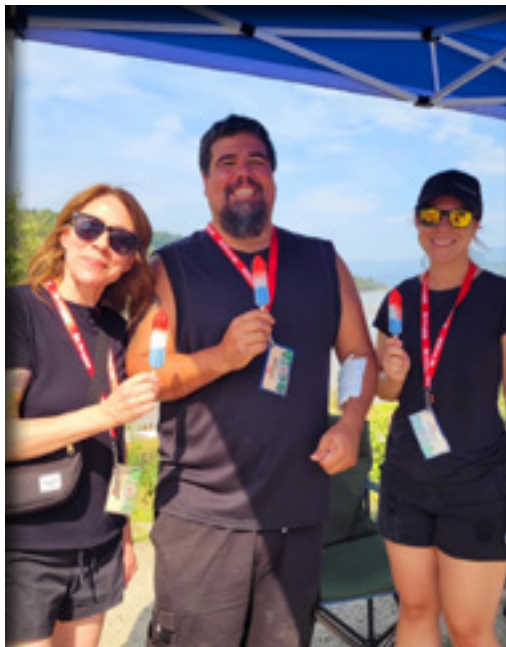
Our Human Resources trio at the Info booth