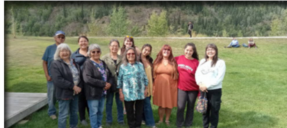
Hän Speakers from Eagle visiting for Moosehide Gathering. Listen to their interview with CBC Radio on www.trondek.ca

For those looking to learn more about the Hän Language, take a class and practice your vocabulary. Join our Hän Hënjik community on Facebook.