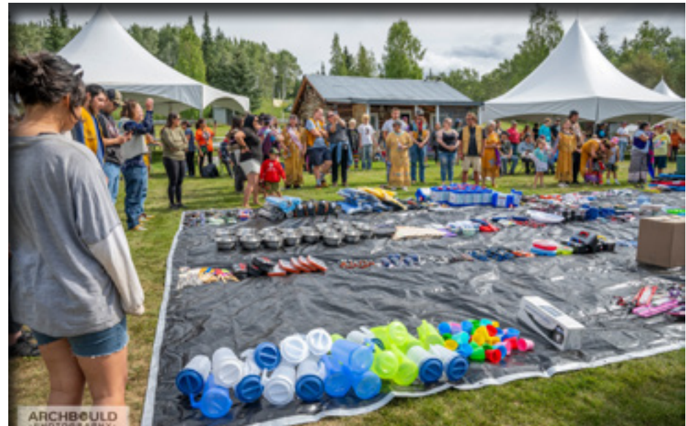
Final day Potlatch