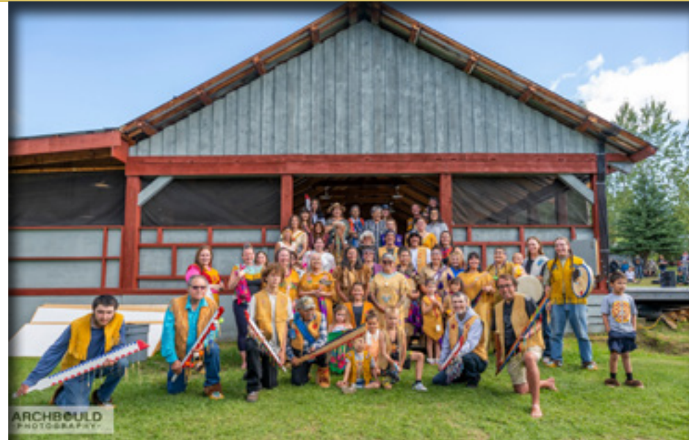
Opening and closing ceremony dancers