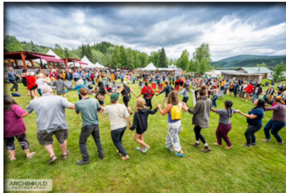
Public Dance on Saturday