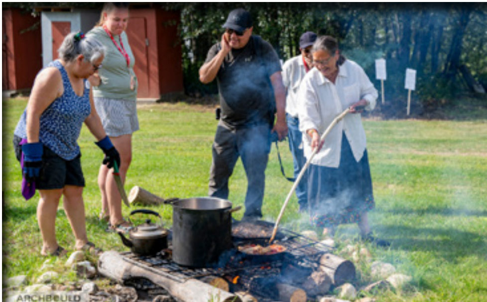
Traditional Cooking at the Heritage Tent