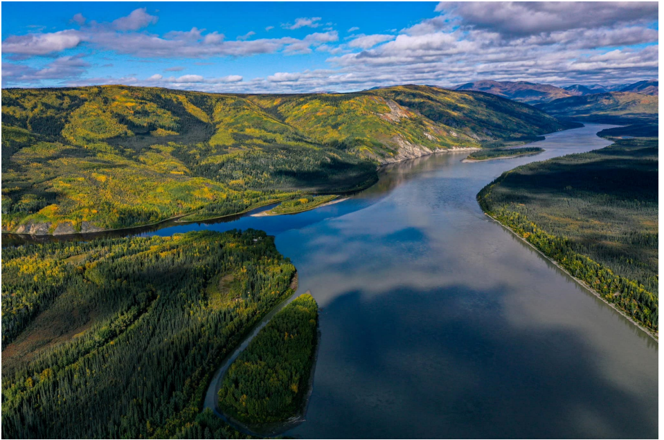
Confluence of Yukon and Fortymile Rivers