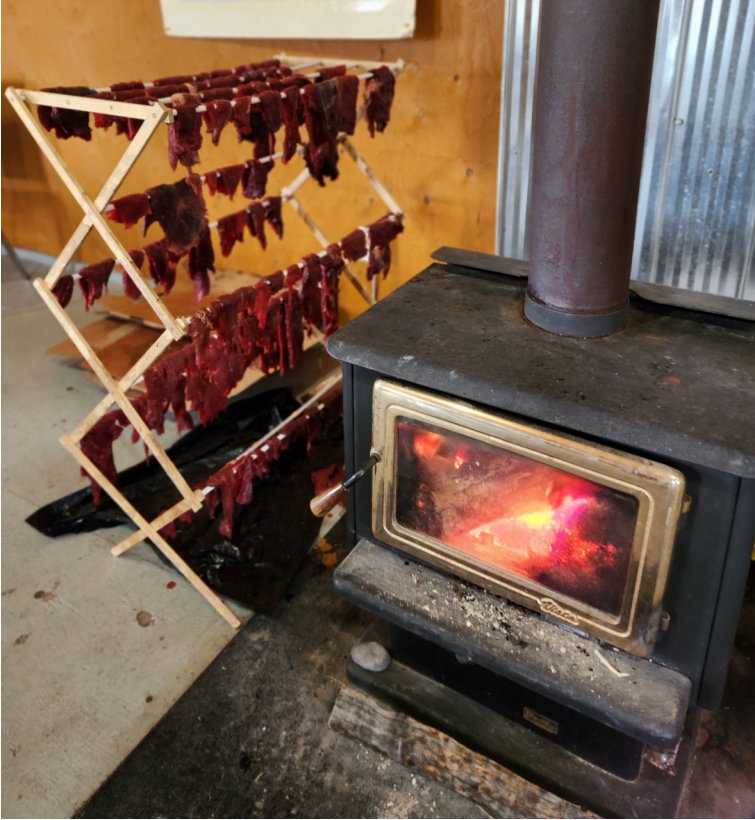
Salmon drying next to a woodstove