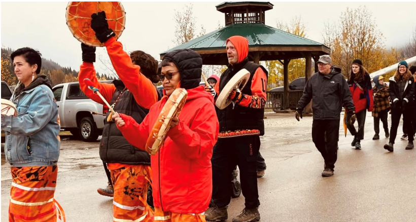
Walking Warriors begin their journey in Dawson.

To our citizens, near and far, we are here to help. 24-hour Residential School Crisis Line 1-866-925-4419.