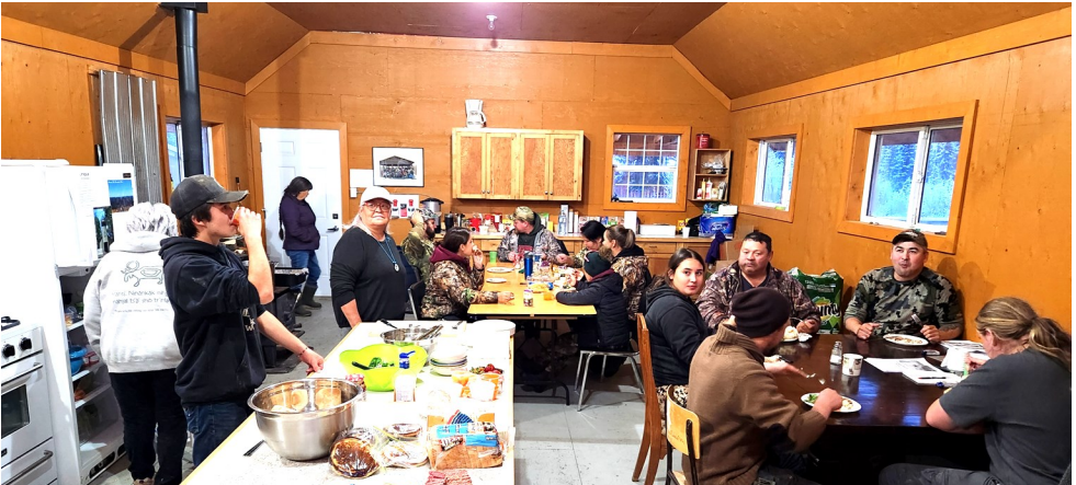
Dinner at the Camp