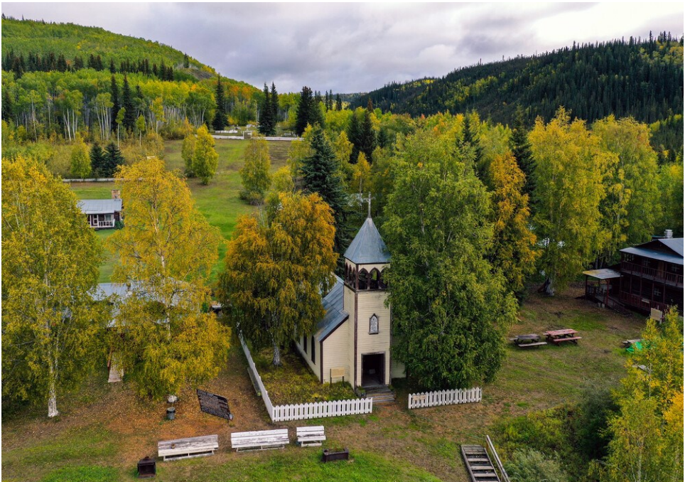
St. Barnabus Church, Moosehide Village