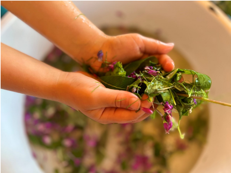
Using the power of medicinal plants and their healing properties at our Wilderness Spa