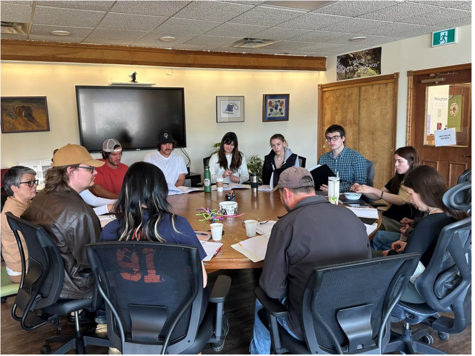
Running a mock Council Meeting