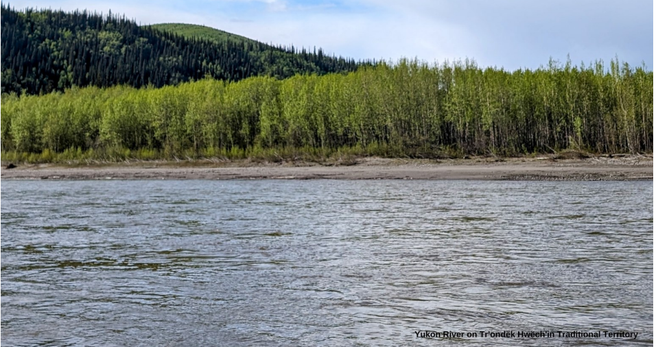
Yukon River on Tr'ondëk Hwëch'in Traditional Territory

Tr'ondëk Hwëch'in Natural Resources and Yukon Government Water Resources Branch invites you to hear from staff and researchers to talk about the importance of water, and how it relates to the work of TH Government and their partners in the TH Traditional Territory. For more information please contact: