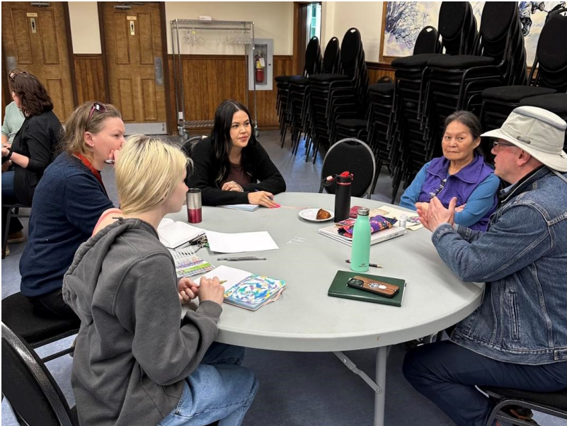
Group Discussions on Government Law